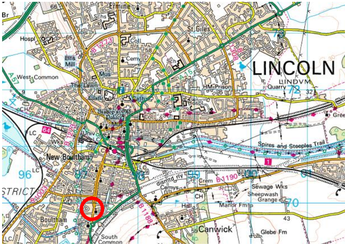
○ St. Botolph's Church. (Lincoln High Street, LN5 8JP)